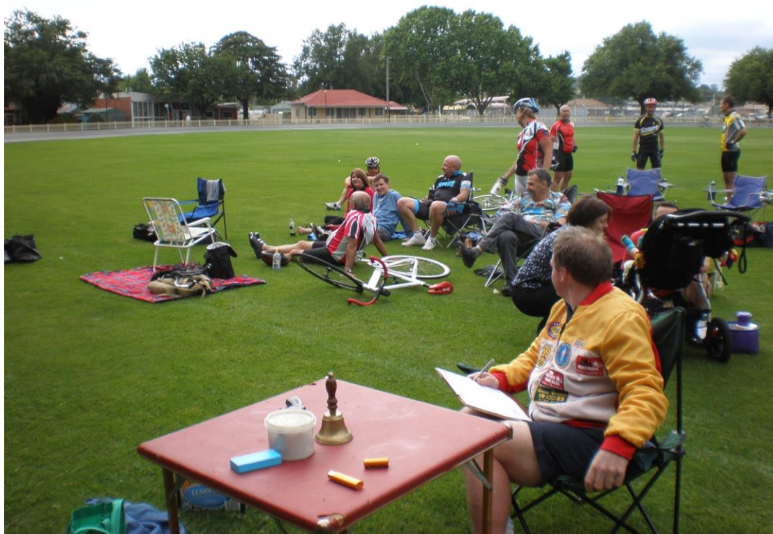
Track Group at Queanbeyan Park 2011