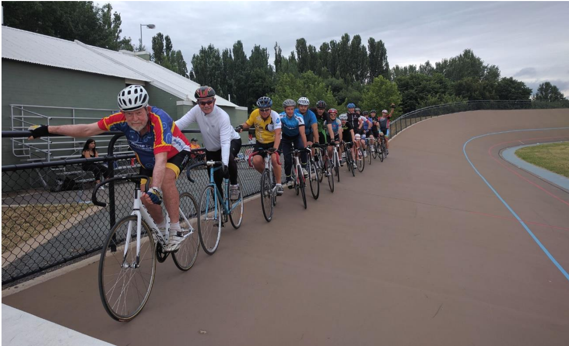
Bundadome 2016 – Xmas Wheel Race Line Up